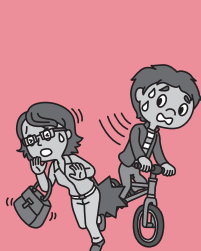
Collision with a pedestrian! If you cause an injury...