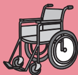
You hit a tree while skiing and become disabled...