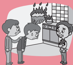
You accidentally set your apartment on fire...

If you (a foreign student) cause an injury to another person or destroy another person's property and are liable to pay compensation for damages due to an accident in your everyday life or an accident while using accommodation/residential facilities for studying overseas, we will pay your insurance claim.